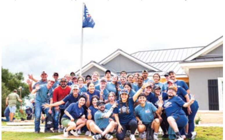
Texas Roadhouse "Roadies" at the 400th home Volunteer Day on September 6, 2024.

Companies, businesses, and corporations, like TXRH, from all over our great nation are helping us make a difference in the lives of our Veterans and their families. And you can too! For more information on how to become a Corporate Partner, please contact our Corporate Philanthropy Team at partnership@hfotusa.org .