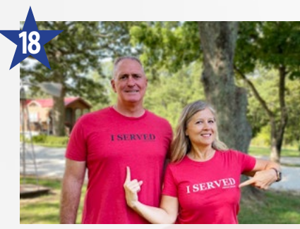
You, Me & the RV $24,174 Location: TX Years Fundraised: 4