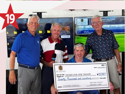
The Golf Club at Fiddler's Creek $23,511 Location: FL Years Fundraised: 1