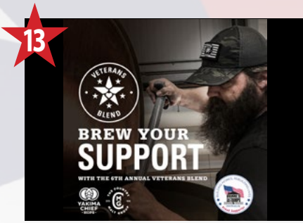
Yakima Chief Hops & Country Malt Group $32,765 Location: WA Years Fundraised: 1