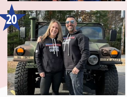
Bridgewater Fitness Center $23,485 Location: MA

$25,700 Location: MA Years Fundraised: 1