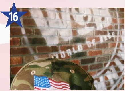
World of Beer Bar & Kitchen $25,147 Location: FL Years Fundraised: 1