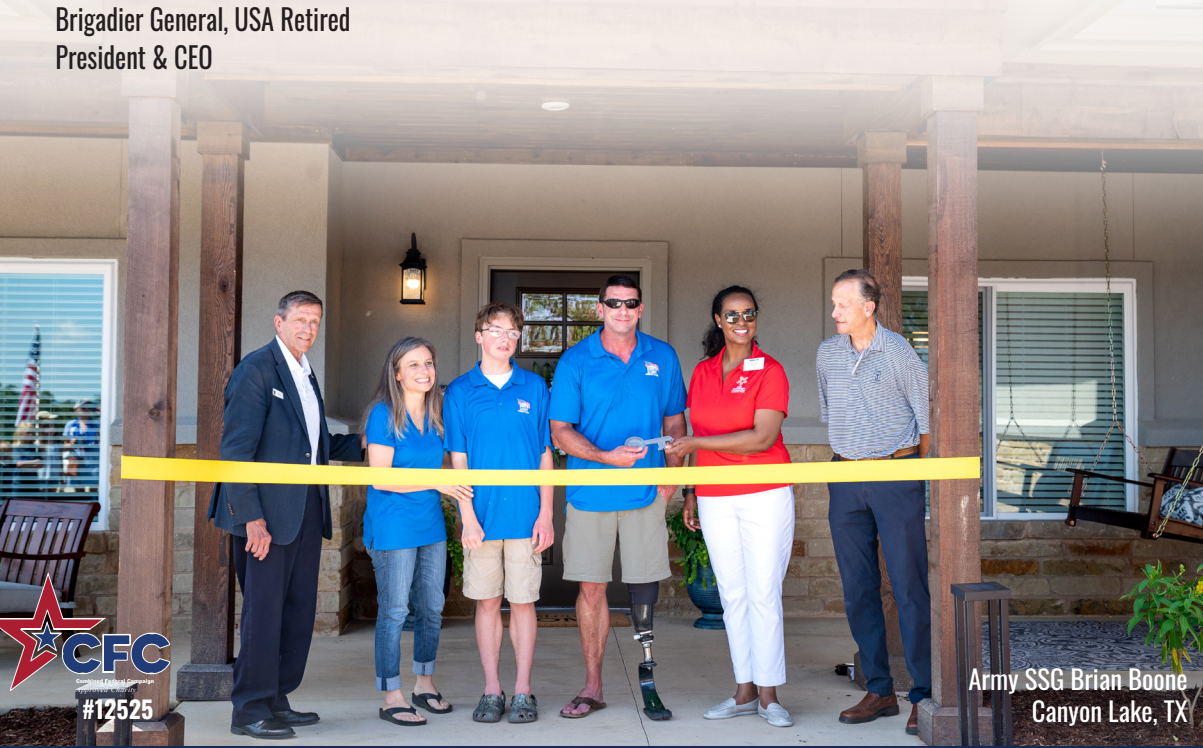
HFOT has been evaluated as one of America's Top Rated Veterans and Military Charities.