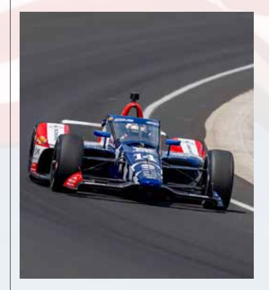
ON THE COVER: Homes For Our Troops at the Indy 500! See page 7.