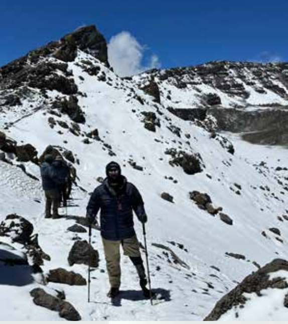
ON THE COVER: Three HFOT Veteran home recipients are "Reaching New Heights", see page 5.