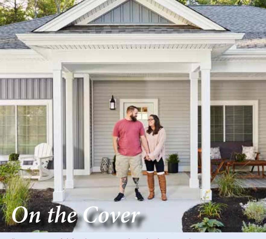
"I am so grateful for the support I have had past and present. I am living my life for more than just myself; I live my life with meaning."

EXPENSES: In FY21, Homes For Our Troops began to see some secondary effects of the pandemic, such as delays in permitting due to local government closures, as well as plans and supply chain issues. As a result, we spent less than we had projected resulting in a $2.5 million surplus, that will be used to build homes in FY22. Even with all of the challenges and delays that the pandemic presented, HFOT maintained its top-rated charity status by being fiscally responsible with your donations, and we were able to spend 86.5 percent of our supporters' donations on the mission in FY21. Since 2004, nearly 90 cents of every dollar spent has gone directly to program services for Veterans. We are especially proud of this track record, as well as our ability to build and donate homes to our nation's most severely injured Veterans, helping them to rebuild their lives through this gift of a specially adapted, custom home.