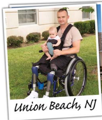
Union Beach, NJ