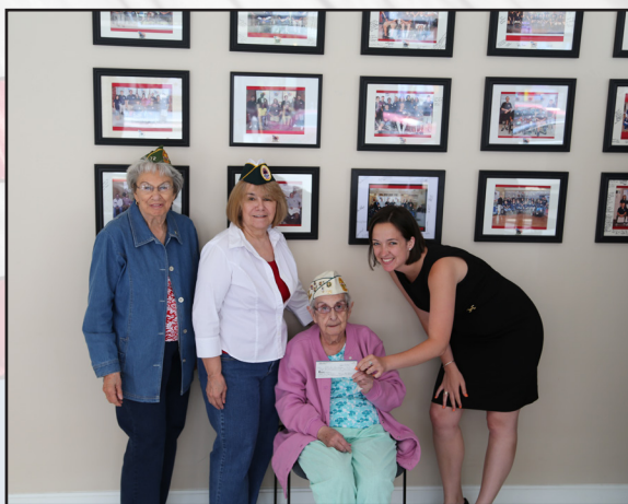
Members of the Somerset American Legion Auxiliary present the fundraising team with a check for their annual charity dinner for HFOT.