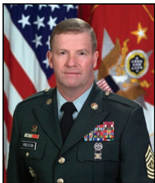
SMA Kenneth O. Preston US Army (Ret) President and Board Director