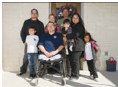
Friday, November 11, 12 noon