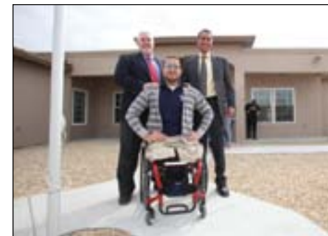
Friday, November 11, 12 noon