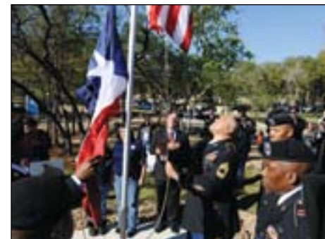
Friday, November 11, 8:30 a.m.