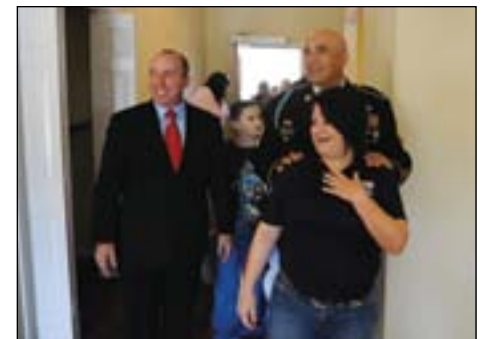
Friday, November 11, 10 a.m.