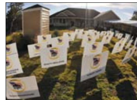
Friday, November 11, 4:30 p.m.

Area residents donated their time and effort to build the home, which is specially