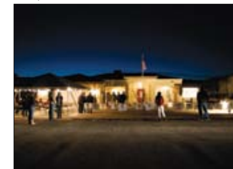
Thursday, November 10, 6 p.m.