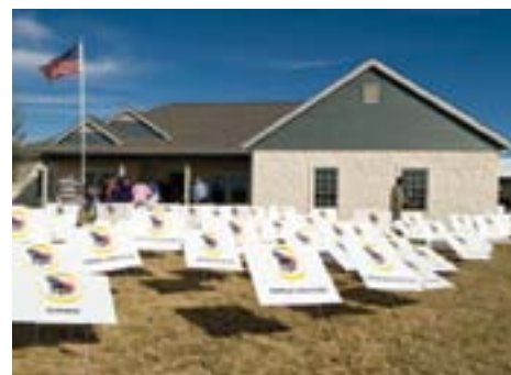
Friday, November 11, 1 p.m.