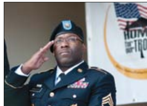
Saturday, November 12, 11 p.m.

“This is the least we can do for our veterans, who have given so much for us,” he said. “I am humbled to have been a part of this meaningful project.”