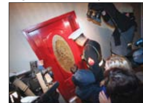
Thursday, November 10, 6:30 p.m.