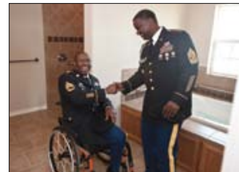
Saturday, November 12, 12:30 p.m.