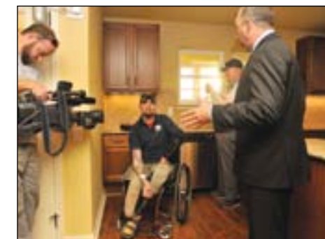
Friday, November 11, 5:30 p.m.