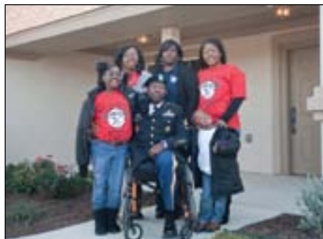
Saturday, November 12, 11:30 p.m.