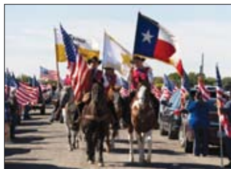
Friday, November 11, 11:30 a.m.