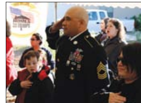
Friday, November 11, 9 a.m.