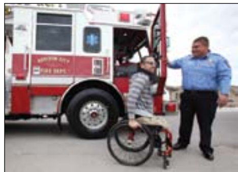
Friday, November 11, 11 a.m.