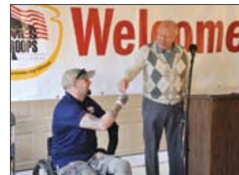
Friday, November 11, 5 p.m.