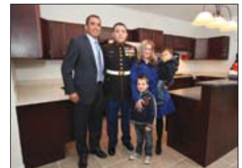
Thursday, November 10, 7 p.m.