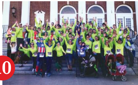
Run For The Troops 5K $37,174 Location: MA Years Fundraised: 9