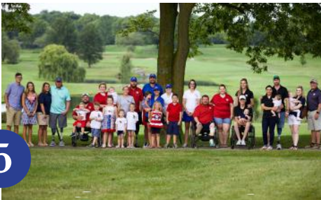
Swings for Soldiers Golf Classic $103,250 Location: KY Years Fundraised: 10