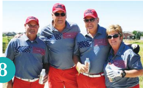
Mulligans for Military Golf $63,645 Location: CO Years Fundraised: 9