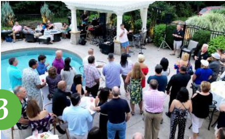
Rado's Annual Charity Event $111,575 Location: CT Years Fundraised: 4