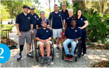
Rosedale Country Club Golf Tournament $157,945 Location: FL Years Fundraised: 7