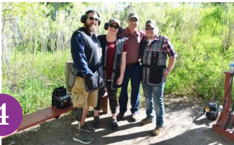
Haselden Construction Clay Shoot $105,618 Location: CO Years Fundraised: 6