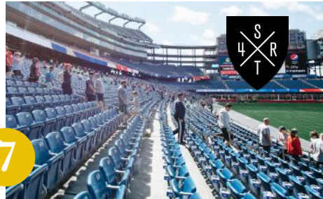
Stairs4RTroops $65,245 Location: MA Years Fundraised: 5