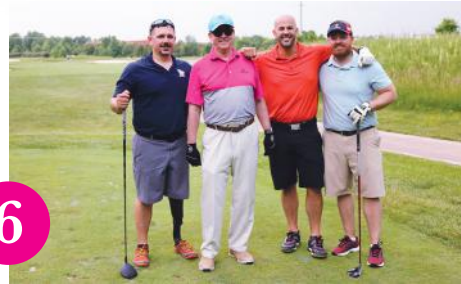
CALIBRE Classic $75,800 Location: VA Years Fundraised: 6