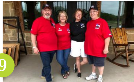
DFW Clay Shoot $55,169 Location: TX Years Fundraised: 10