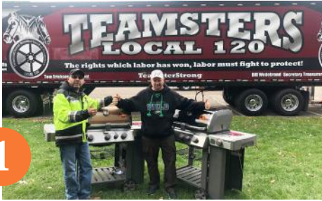
Teamsters Local 120 Picnic & Golf Tournament $167,088 Location: MN Years Fundraised: 4