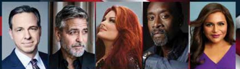
Hosted by Jake Tapper, George Clooney, Wynonna Judd, Don Cheadle, and Mindy Kaling