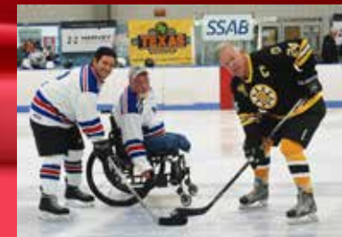
Hockey Night For Veterans Years Fundraised: 3