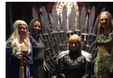
Game of Thrones Birthday Bash Years Fundraised: 1