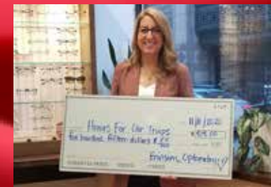
Envision Optometry Gives Back Years Fundraised: 1