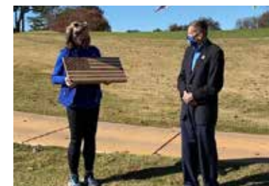
Huntsville Golf Classic Years Fundraised: 2