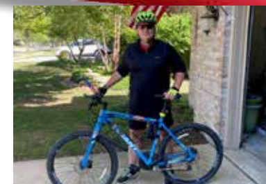
PECO Week of Motion Years Fundraised: 1