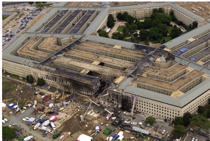
The aftermath of the Pentagon attack, Sept. 11, 2001.

While all this was going on, the news networks reported the crash of Flight 93 in Somerset, Penn. We would later learn the details of how several brave men and women gave their lives to fight the terrorists and disrupt the plan to crash the plane into the White House or the United States Capitol.