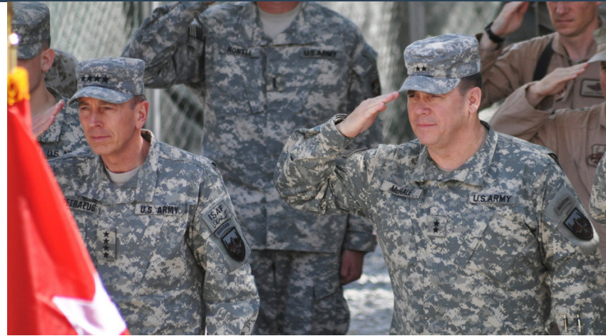
Remembrance Ceremony Sept. 11, 2011 Kabul, Afghanistan ... We will never forget!