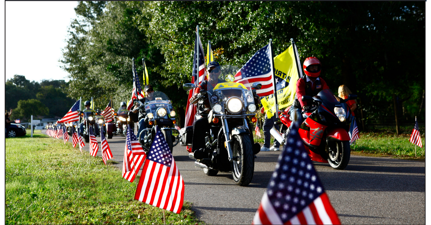
Members of the Patriot Guard Motorcycle Riders en route to an HFOT event in Texas.