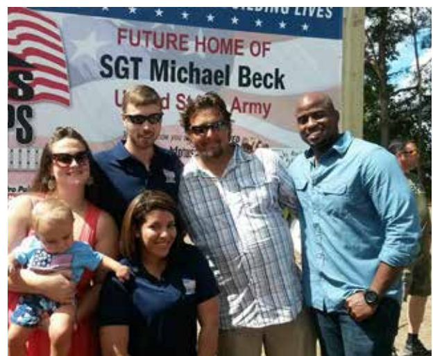
HFOT Groundbreaking event for Beck, September 2014.